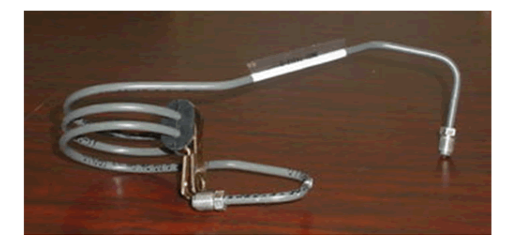
Figure 1: Curtis-Maruyasu America, Inc. Chassis Tubes

84. An "Automotive Steel Tube" is used in fuel distribution, braking, and other automotive systems. Automotive Steel Tubes are sometimes divided into two categories: chassis tubes and engine parts. Chassis tubes, such as brake and fuel tubes, tend to be located in the body of a vehicle, while engine parts, such as fuel injection rails, oil level tubes, and oil strainer tubes, are associated with the function of a vehicle's engine.