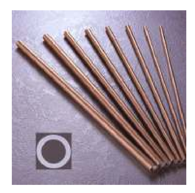
Figure 3: Usui Kokusai Double Walled Steel Tubes

Figure 2: Curtis-Maruyasu America, Inc. Engine Parts