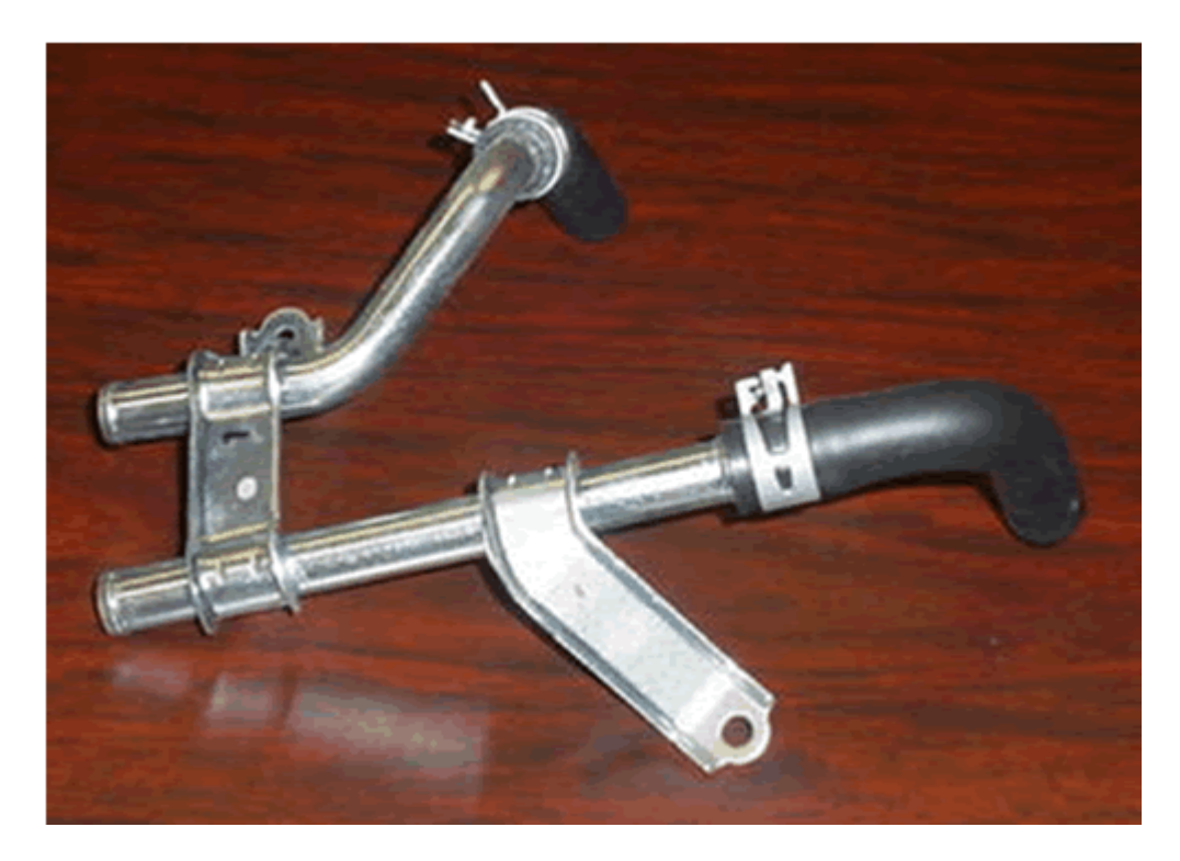
Figure 2: Curtis-Maruyasu America, Inc. Engine Parts